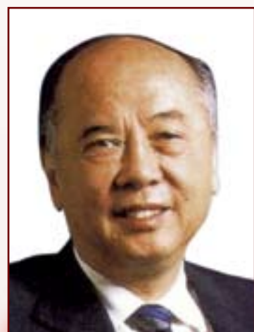
Chairman Mr Wee Cho Yaw 主席 黄祖耀先生